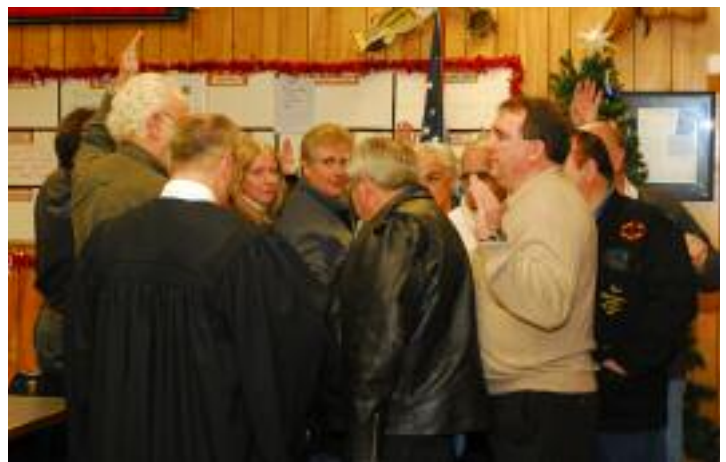
The 2010 Elected Board of Directors were sworn in at the General Membership meeting on January 6th.